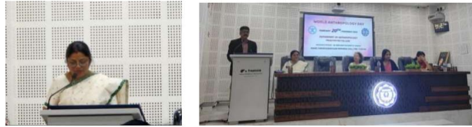
Photo 4: Glimpses of the Program