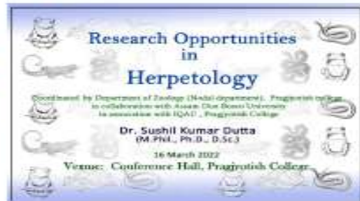
Photo 8: Poster of the event "Research Opportunities in Herpetology"