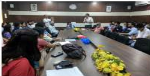
Photo 7: Open discussion session