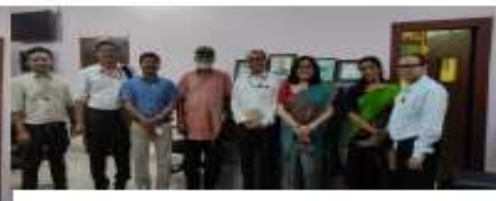
Photo 4: Group photo of the event