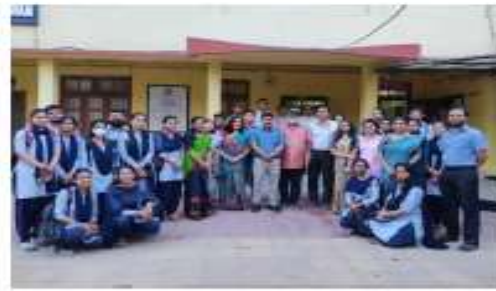
Photo 1: Group photo of the event