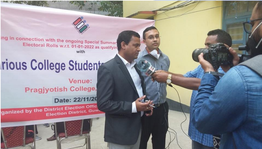
Voters Awareness Campaign