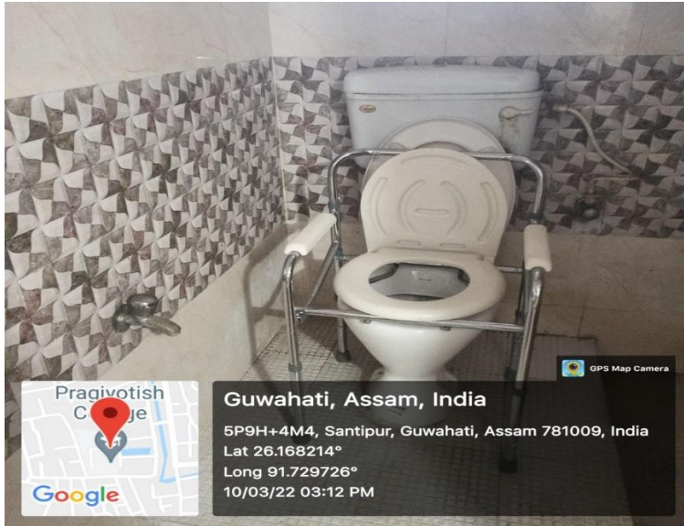
Divyangjan-Friendly (differently-abled) student's washrooms for both Female and Male