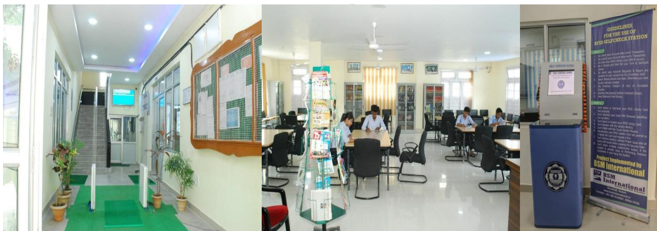
Fig: Library facilities with sophisticated self book issue and return computer system