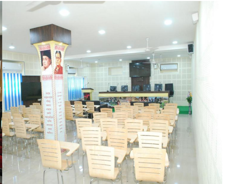
Fig: Digital Smart Classroom cum Conference Hall