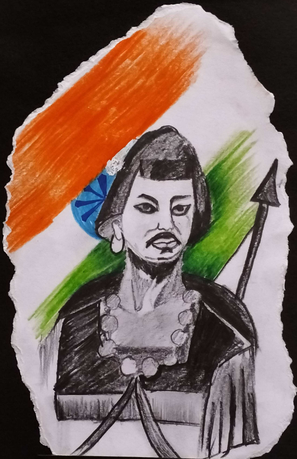
Vijesti Singa Sjerra